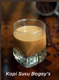
Kopi Susu Bogey's