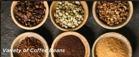
Variety of Coffee Beans

Halu Banana with Yellow Honey Processing Banana, Oranges, Honey or Cotton Candy Hints. Perfect for who loves adventuring their coffee taste.