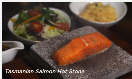
Tasmanian Salmon Hot Stone

Served with vegetable of the day, a choice of mashed potato, roasted herb potato wedges, baked potato sour cream or boiled sweet potato and a choice of sauce, green peppercorn, barbeque or bearnaise sauce.