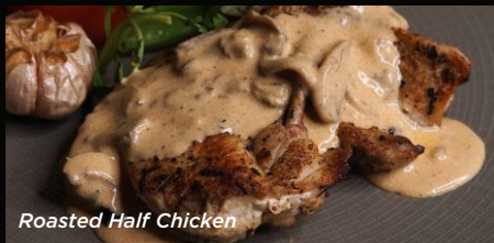
Roasted Half Chicken

Japanese udon noodle served with Naruto maki, ajitamago, tempura shrimp, leek slice, egg, and tofu.