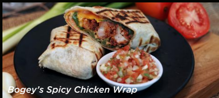
Bogey's Spicy Chicken Wrap