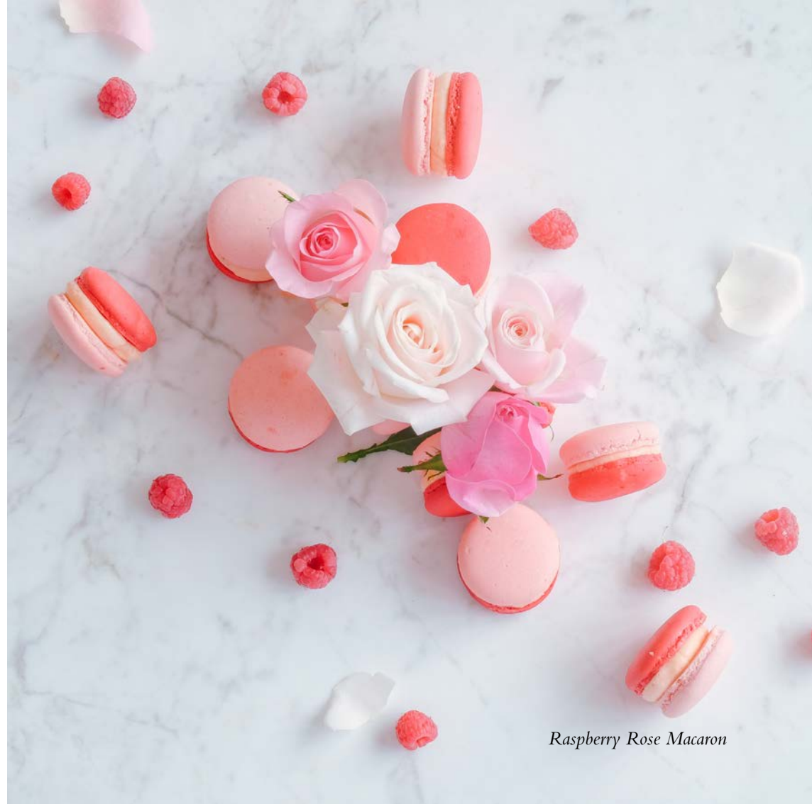
Raspberry Rose Macaron

All prices are times 1,000 in Vietnam Dong (VND) and are subject to service charge and then VAT