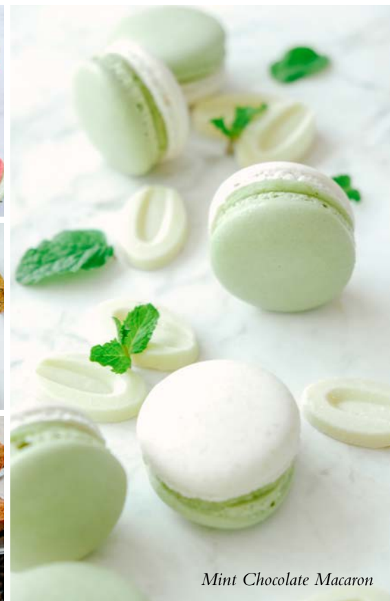
Mint Chocolate Macaron