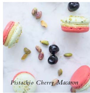
Pistachio Cherry Macaron