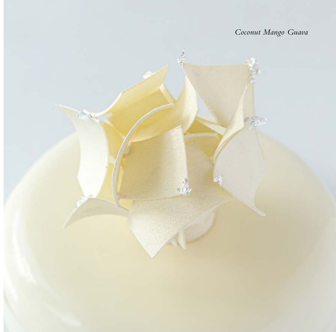
Coconut Mango Guava

All prices are times 1,000 in Vietnam Dong (VND) and are subject to service charge and then VAT