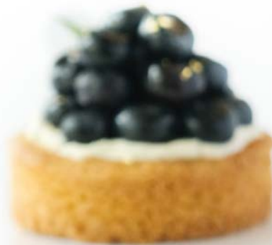
Blueberry Crème Fraîche Tart