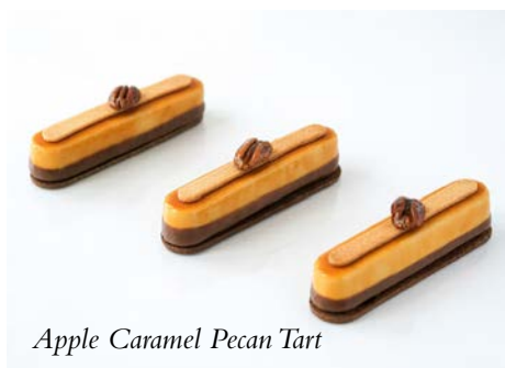
Apple Caramel Pecan Tart