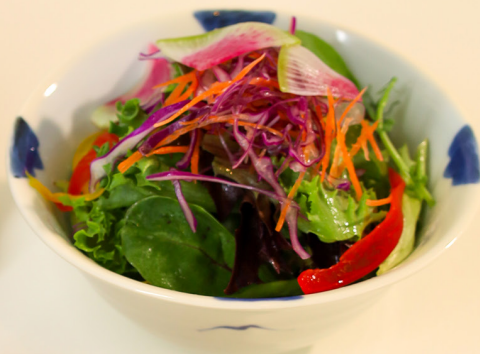
季節の小鉢 Seasonal appetizer