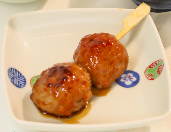
炉端鶏つくね串 Robata chicken balls in teriyaki sauce