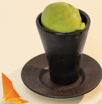
抹茶アイス Matcha Ice Cream