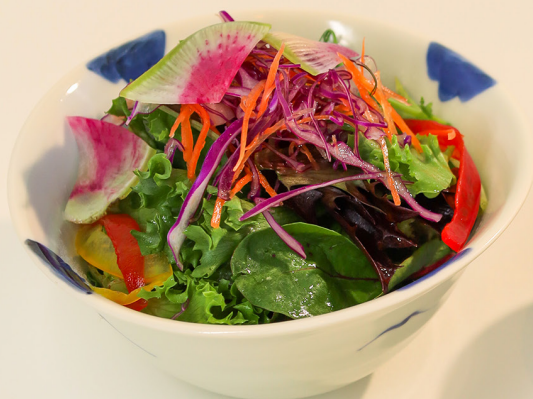
生野菜サラダ和風ドレッシング Fresh mixed vegetable salad