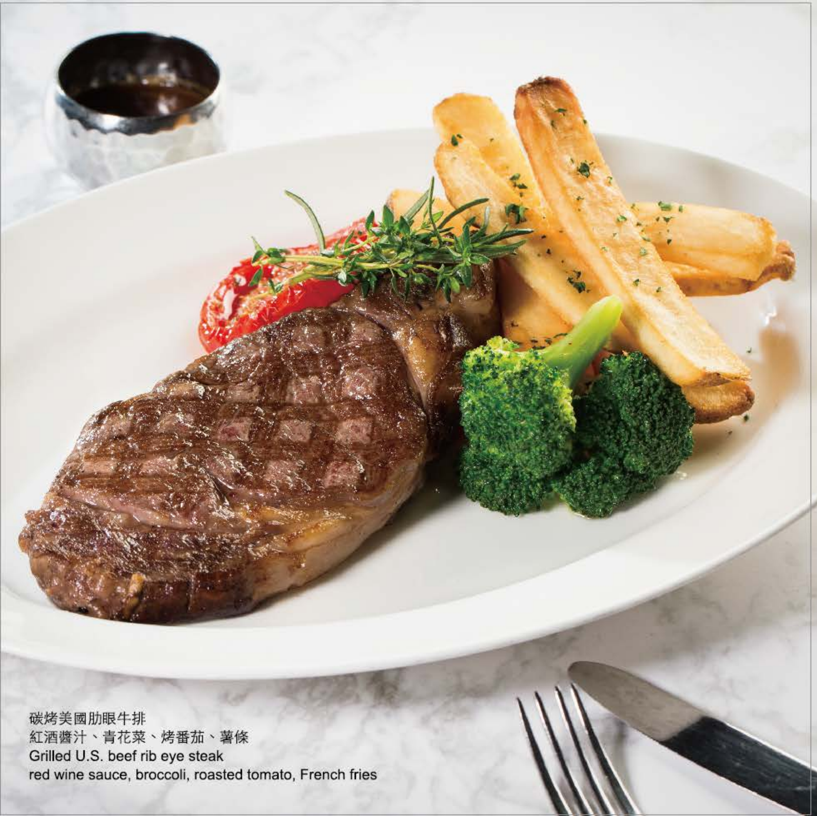
碳烤美國肋眼牛排 紅酒醬汁、青花菜、烤番茄、薯條 Grilled U.S. beef rib eye steak red wine sauce, broccoli, roasted tomato, French fries