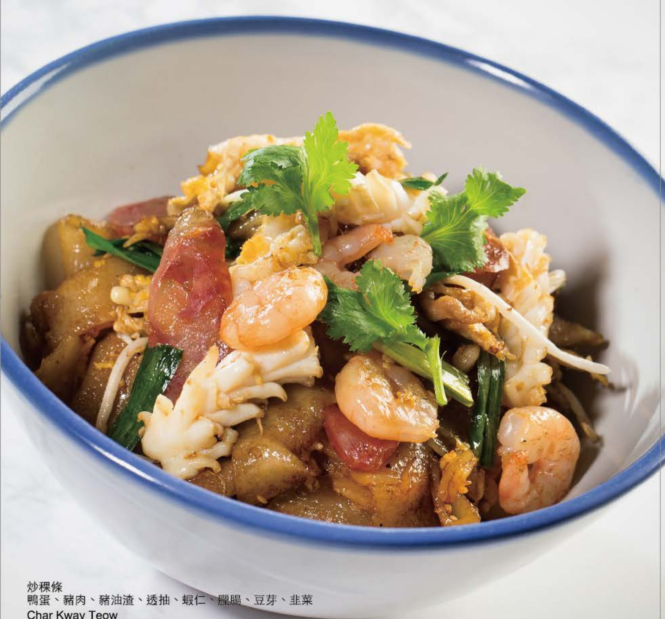
炒粿條 鴨蛋、豬肉、豬油渣、透抽、蝦仁、臘腸、豆芽、韭菜 Char Kway Teow duck egg, pork, pork lard, squid, shrimp, preserved sausage, bean sprout, green chive