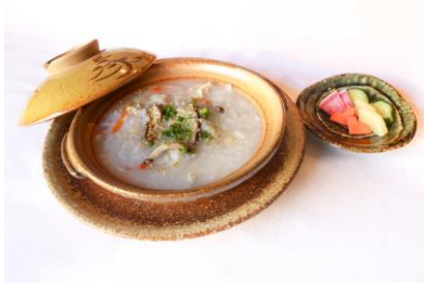
Rice porridge, chicken, vegetables, sesame | 1,239 (1,500)