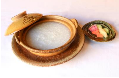
Rice porridge | 991 (1,200)