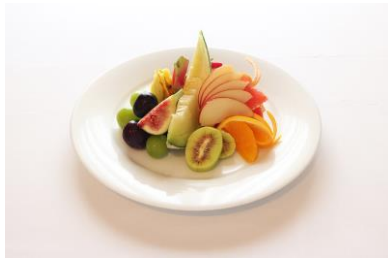
Assorted fresh fruits | 2,231 (2,700)