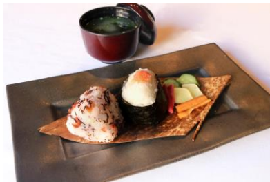
Rice ball (Mentaiko, Japanese plum and seaweed) | 991 (1,200) with miso soup and pickled vegetables