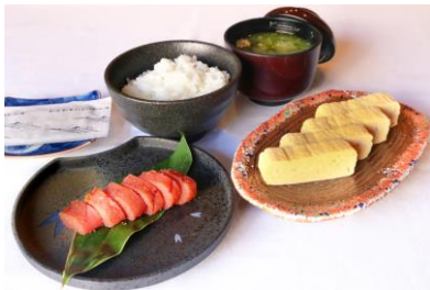
Steamed rice | 413 (500)