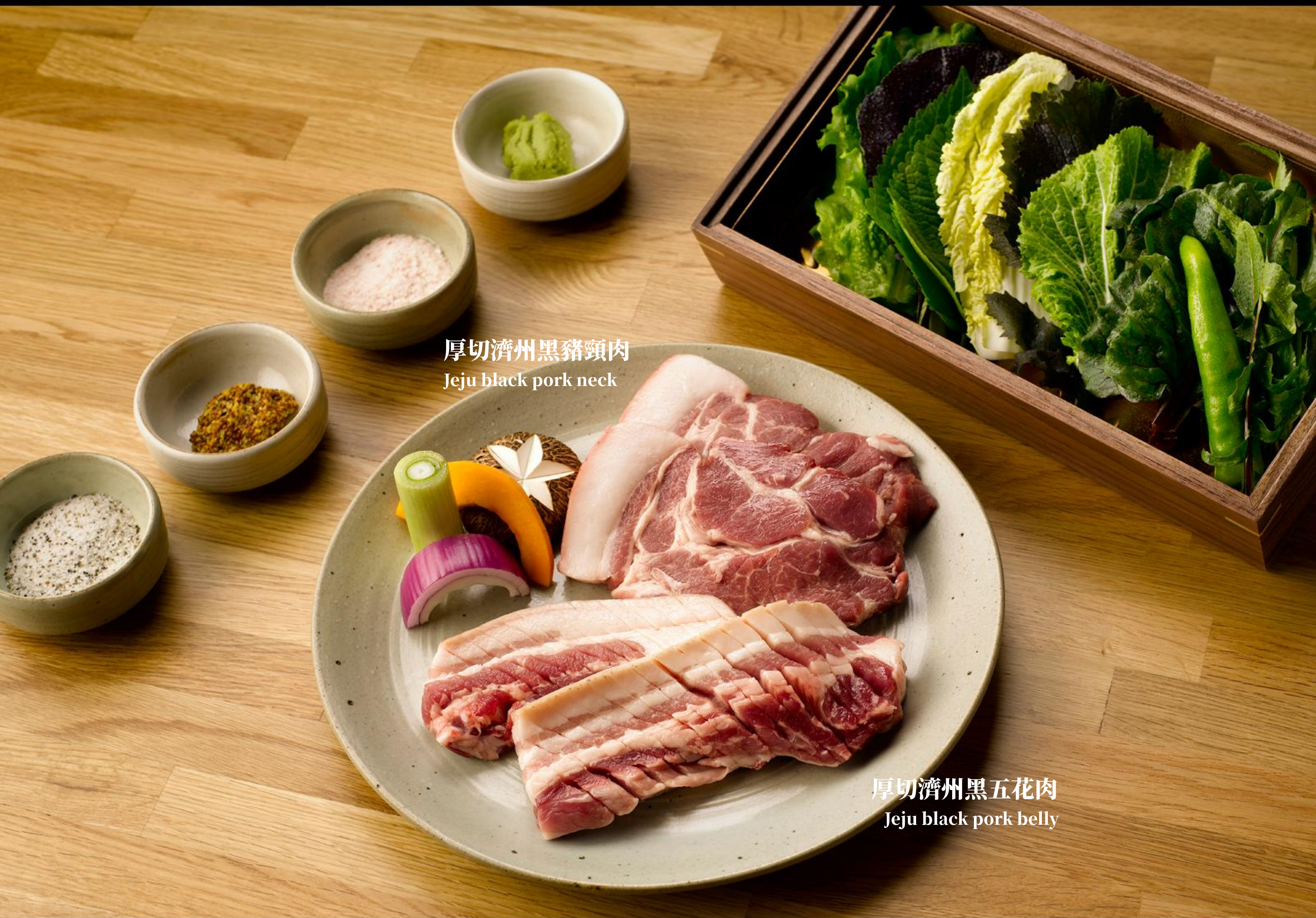
厚切濟州黑豬頸肉 Jeju black pork neck