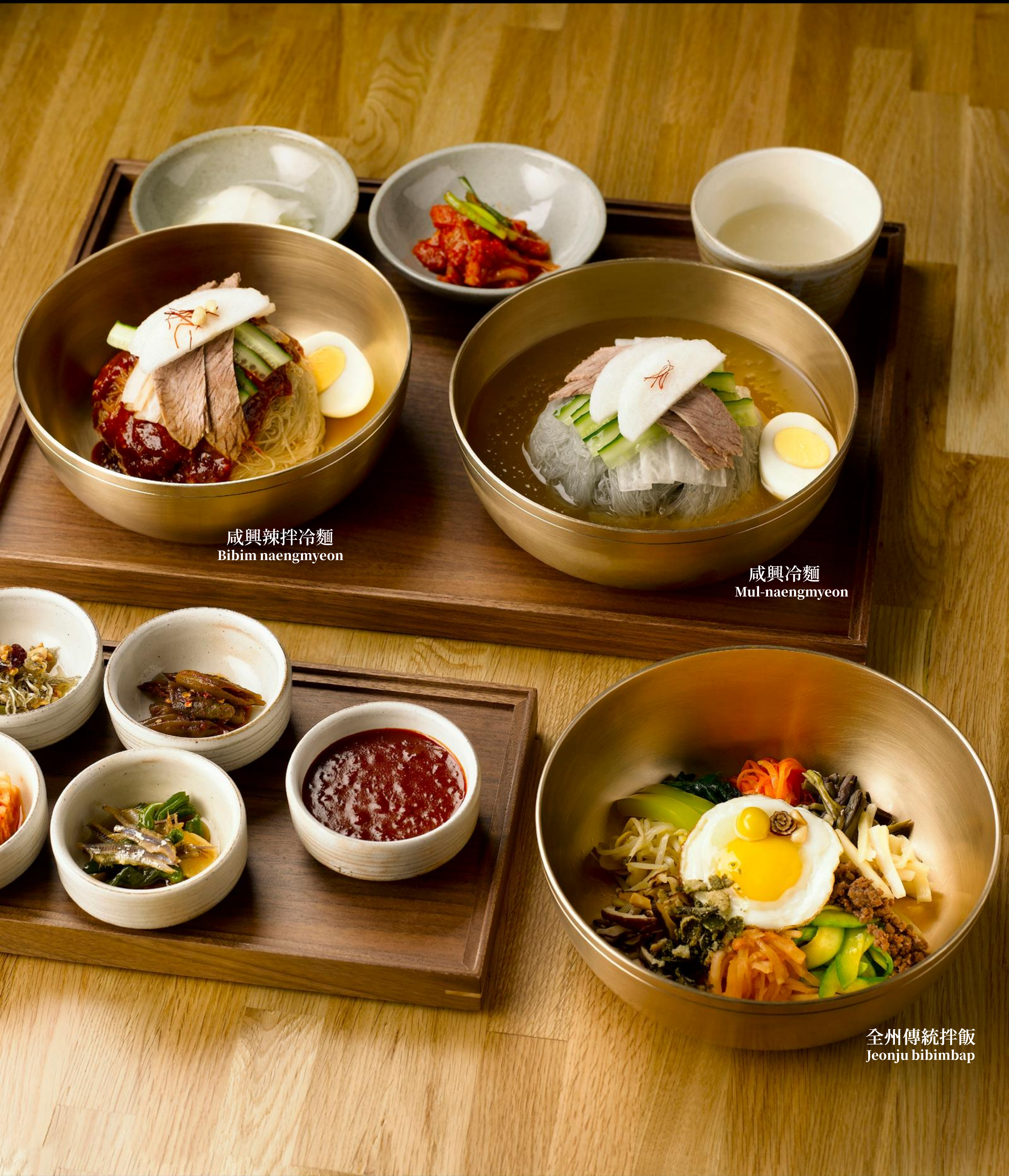
咸興辣拌冷麵 Bibim naengmyeon