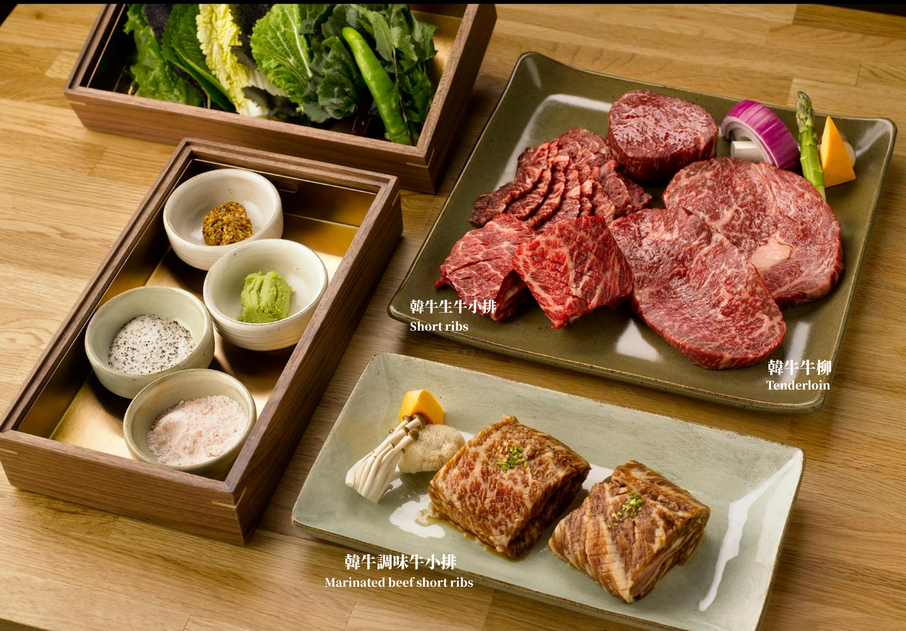
韓牛生牛小排 Short ribs