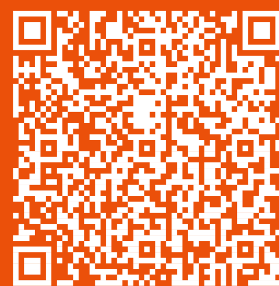
KIDS BIRTHDAY PARTY MENU