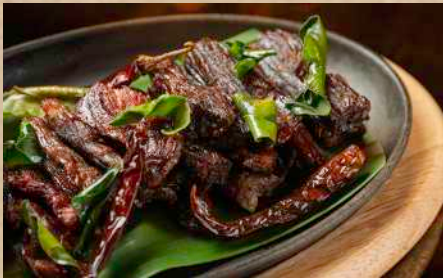
DRIED BEEF, GARLIC VINEGAR