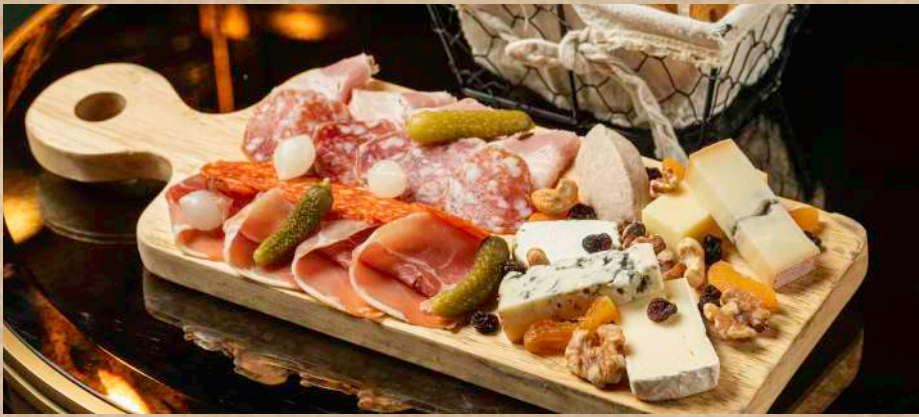
CHARCUTERIE AND CHEESES PLATTER