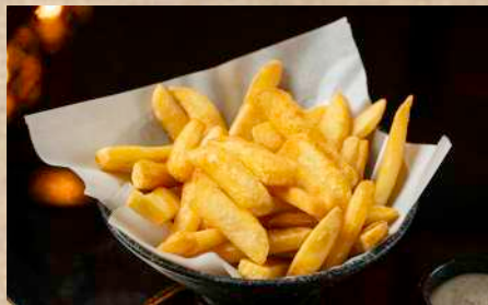
STEAK CUT FRIES TOGARASHI, TRUFFLE MAYO