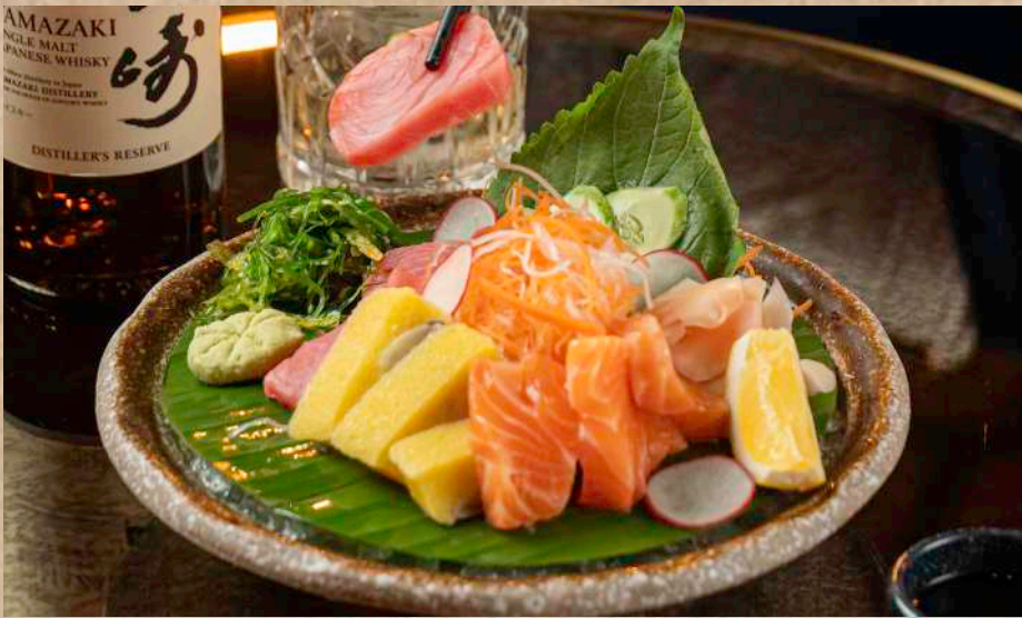
SASHIMI SELECTION TUNA, SALMON NISHIN & CONDIMENTS