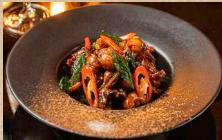
STIR-FRIED FROG LEGS HOLY BASIL CHILI