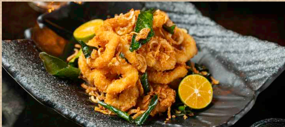
SALT AND PEPPER CALAMARI KALAMANSI