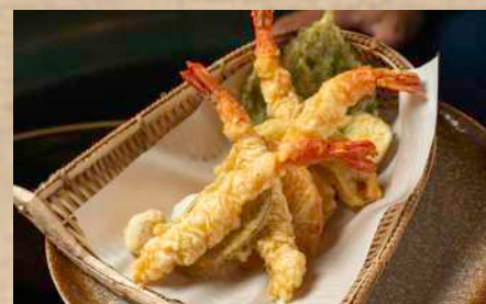
PRAWNS & VEGETABLES TEMPURA