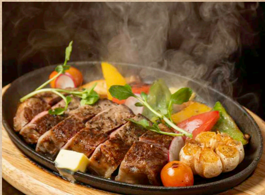
GRILLED AUSTRALIAN BEEF STRIPLOIN KAMPOT BLACK PEPPER DIP