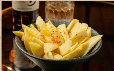
GREEN MANGO CHILI DRIED SHRIMP SALT