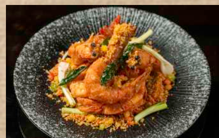
FRIED SHRIMP SPICY GARLIC PEPPER