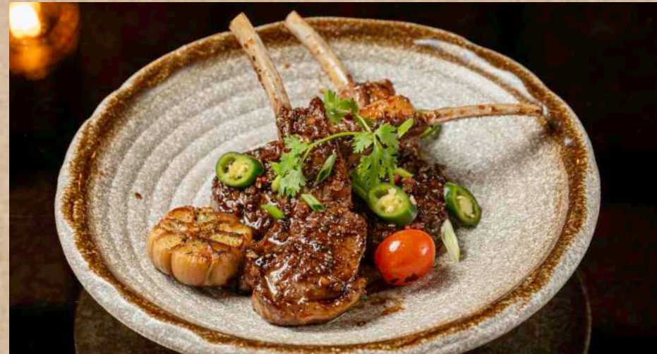
SICHUAN PEPPER & HONEY GLAZED LAMB CHOP