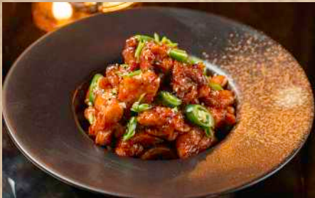
GOCHUJANG CRISPY CHICKEN