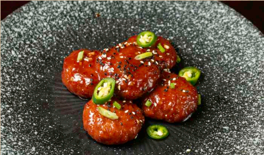
PLANT BASED OMNI MEAT GOCHUJANG, SESAME SEED, GREEN ONION