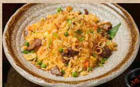
BEEF FRIED RICE