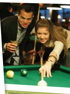
INTERNATIONAL BALLET THEATRE BILLIARDS

Bellevue is rich in lifestyle entertainment.